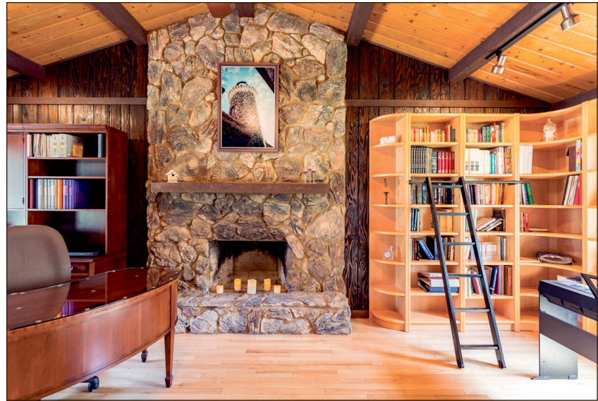
A house for sale in Itasca. Below: Swimming pool at the top of a high rise on Lake Shore Drive in Chicago.