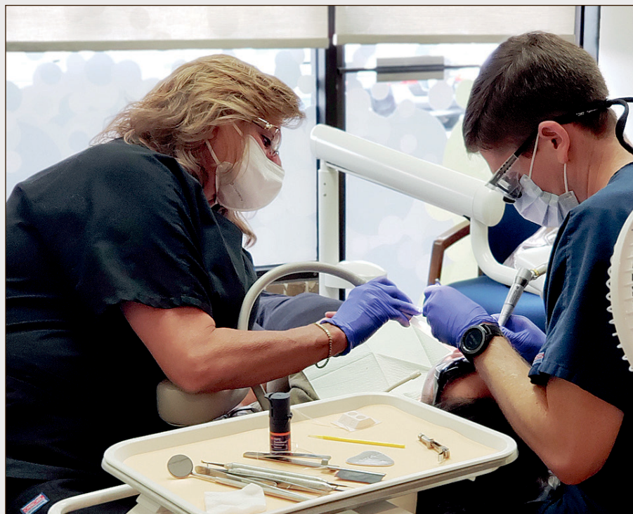
Elk Grove Family Dental provided much needed services for local residents on Free Dental Day.

Prince of Peace Church allowed the use of their facilities for additional space, and Elk Grove Village and the police department assisted in providing their resources and services.