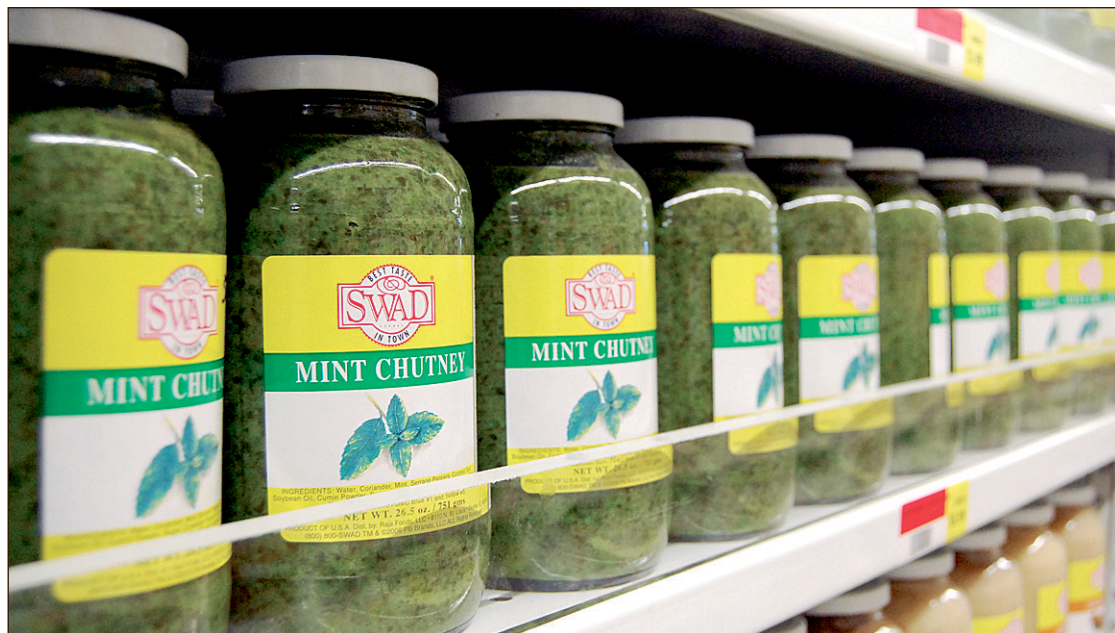
Jars of Swad, made by Raja Foods, line shelf at a local Patel Brothers grocery store.