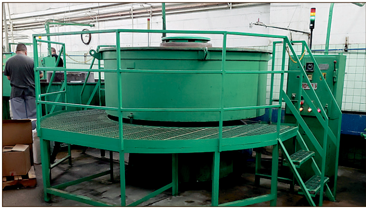
A vibratory tumbling machine on the shop floor at KVF Company processes helicopter gears.