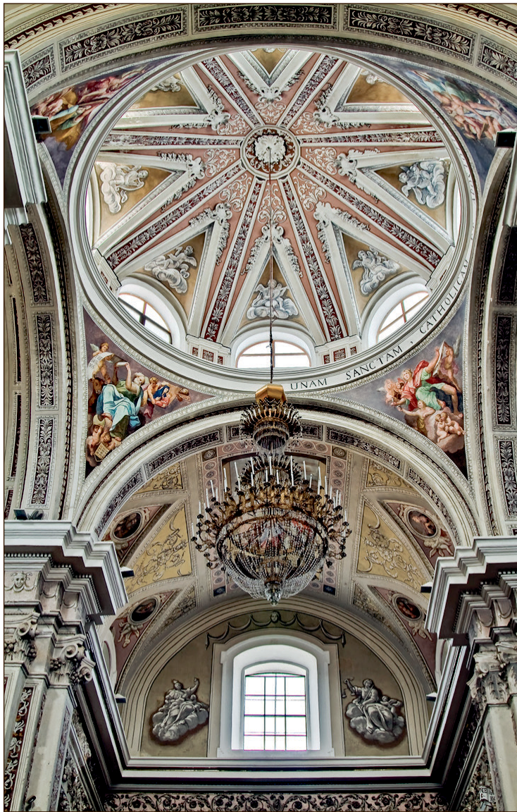
A cathedral in Termini Immerge, Italy, sister city to Elk Grove Village.